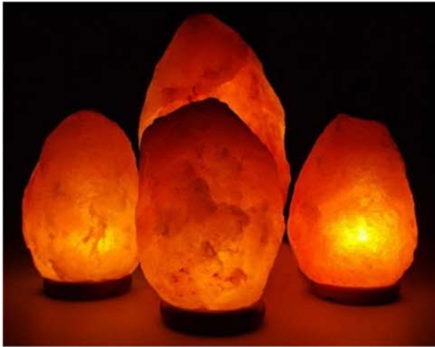
Himalayan Salt Lamps are natural air purifiers used for air purification.

Have you ever heard of a salt lamp before? I had